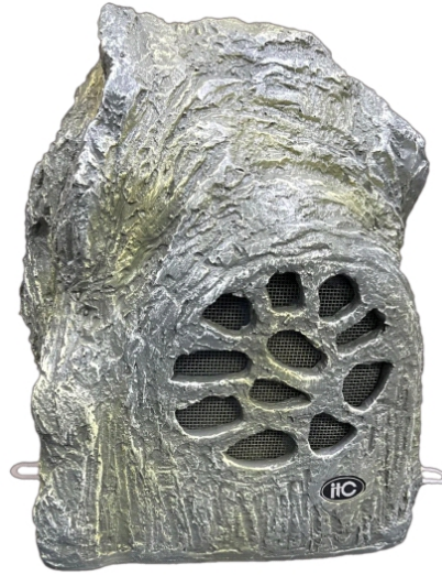
Material: organic resin