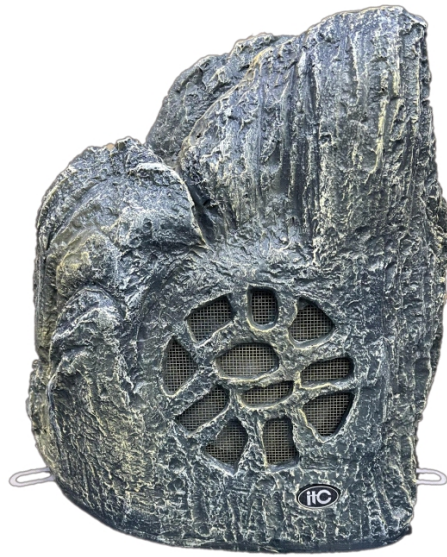
Material: organic resin